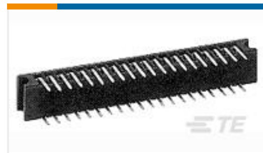
TE Part # 534204-1 50 MODU 2-PC CE RECP ASSY