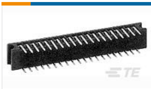
TE Part # 532956-8 50 MODII 2PC CE RCPT ASSY